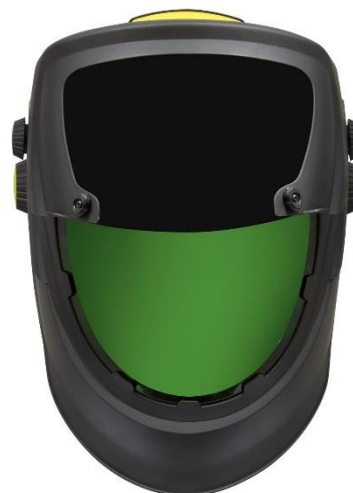
Large inner grinding visor